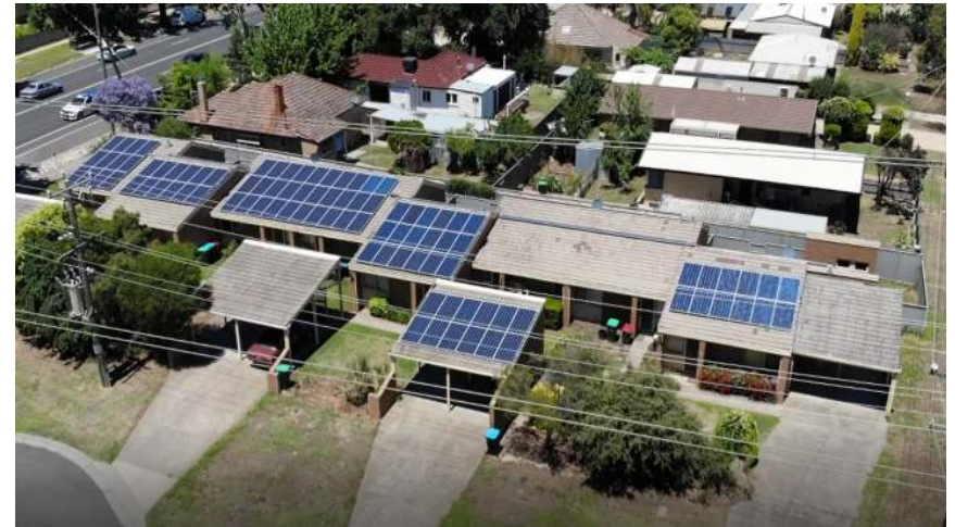
CHVL - 8 Social Housing Units 30kW $30K