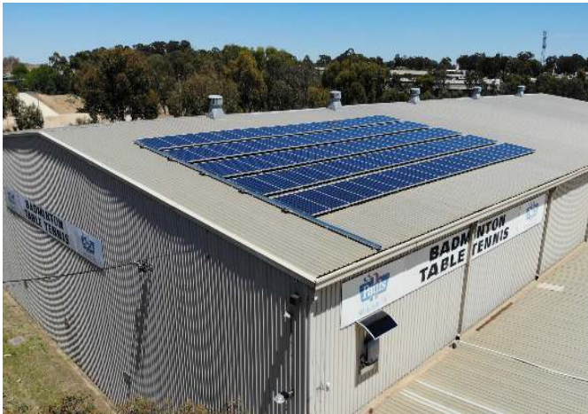
Eaglehawk Stadium 30kW $30K